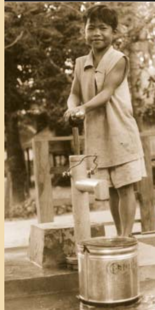
Community hand-pump well

Partners for Development has introduced community hand-pump wells, installed low-cost water filters and constructed community-owned and managed piped-water systems. Over 1200 wells and water points have been installed benefiting over 160,000 rural residents.