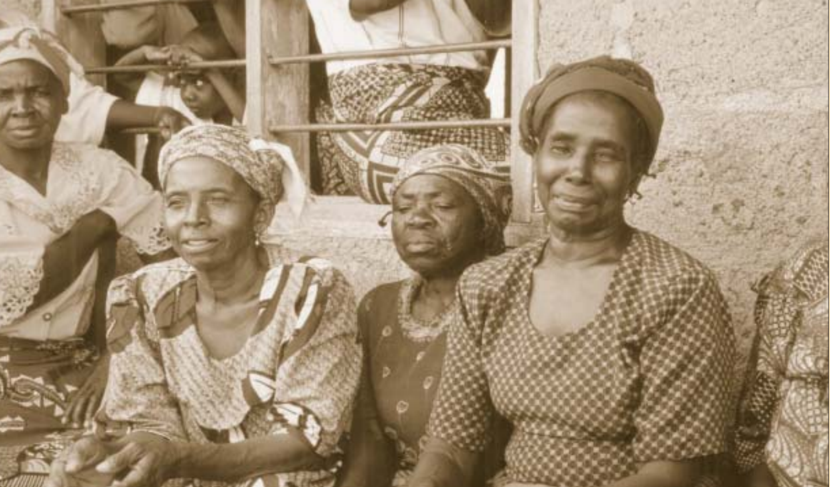
Reproductive health education is conducted at the village level

Partners for Development responded to these dual demands by integrating health education components into programming in existing projects in the Small Enterprise Development (SED) sector.