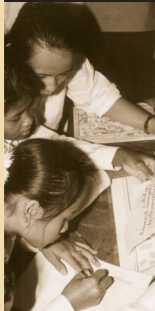
Child-to-child nutrition education

Partners for Development has made health education and training essential components of its health programming, with the goal of leaving skills, knowledge, and methodologies in the hands of our local partners.